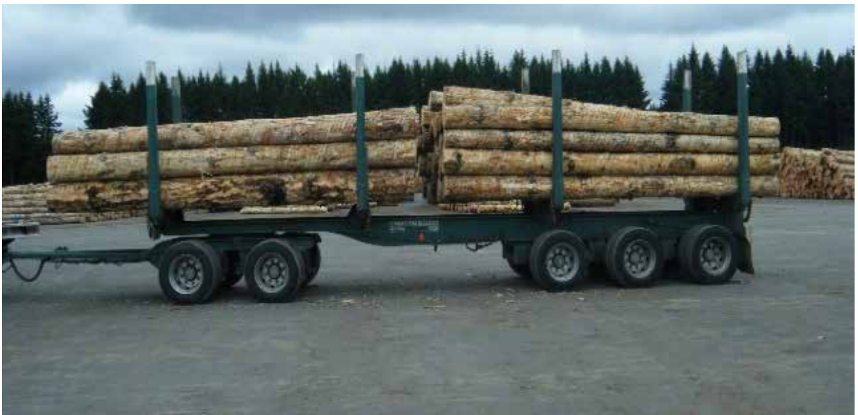
Preferred – Same load double bunked. Also note taper in the load.